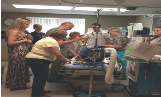
Emergency Department Staff keeping their skills up-to-date